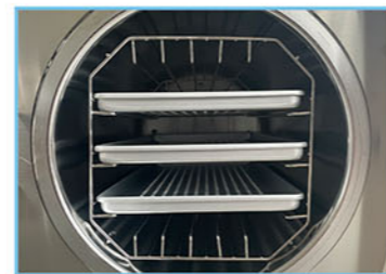
Aluminum Tray (Standard)