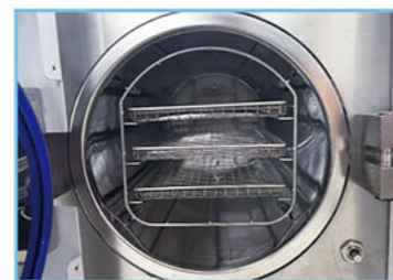
Stainless Steel Tray (Optional)